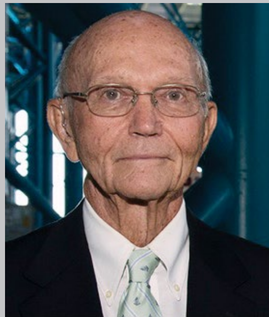
Michael Collins was the Command Module Pilot for Apollo 11.